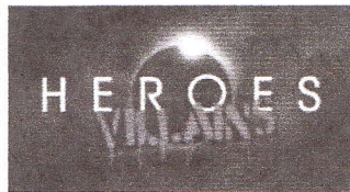
Logo for Heroes Volume 3

Season three opened with two one-hour episodes, airing on Monday, September 22, 2008 in the United States. [27] The premiere of the third volume, "Villains", was preceded by a one-hour broadcast of the red carpet premiere, with clips from the past seasons and previews of the upcoming season, along with interviews with the series cast and crew. [13] "Villains" was originally designed to be included within the second season; however, due to the writers' strike, the volume was carried over into season three. The lead-in to "Villains" showed Sylar regaining his lost powers, shown as the final scene of the "Generations" finale. Tim Kring has said that the new volume will bring a cadre of villains to the show, hence the title. [28] On December 5, 2007, at the Jules Verne Film Festival Adventure, Tim Kring showed a video-preview of volume three. [29] According to an interview with Allan Arkush, filming for season three began on May 1, 2008. [30] On May 9, 2008, a season three promo clip was released with hints at possible "inner villains" within the heroes. The promo stated, "In every hero there could be a villain," before plastering the words "hero" and "villain" over the face of every major character. Finally, during the featured Heroes panel at the San Diego Comic-Con, the entire first hour of the first episode of the "Villains" arc was shown. [31]