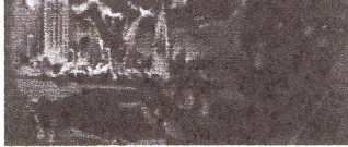
Isaac's painting of Manhattan's destruction in "Genesis" - the following episode, set five weeks in the future, depicts the same explosion, and the painting forms the basis of the primary story arc of the first season.

consisted of Volume One, known as "Genesis". The series went on hiatus twice; first from December 4, 2006 to January 22, 2007, [17] and again from March 5 to April 23, 2007, [18] with the season finale airing on May 21, 2007. [19] The volume begins as a seemingly ordinary group of people gradually become aware that they have special abilities. Events illustrate their reactions to these powers, and how the discovery affects their personal and professional lives. At the same time, several ordinary individuals are investigating the origins and extent of these abilities. Mohinder Suresh, a geneticist, continues his late father's research into the biological source of the change, while Noah Bennet represents a secret organization known only as the "Company". While coping with these new abilities, each of the characters is drawn, willingly or unwillingly, into the Company's conspiracy to control superpowered people and into a race to stop an explosion from destroying New York City.