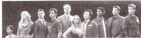
From left to right: Noah Gray-Cabey, Ali Larter, Adrian Pasdar, Milo Ventimiglia, Jack Coleman, Hayden Panettiere, Masi Oka, Sendhil Ramamurthy, Greg Grunberg, Zachary Quinto

Originally, Kring designed the series to have an ever-shifting cast. However, his motivation changed when he realized how popular the original cast was with audiences; therefore he brought back most of the first season cast for the second season, with a few additions who received star billing. [36] In its first season, the show features an ensemble cast of twelve main characters making it the third largest cast in American primetime television behind Desperate Housewives and Lost . Although NBC's first season cast page listed only ten characters, [37]